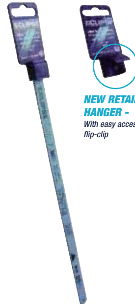
NEW RETAIL HANGER - With easy access flip-clip