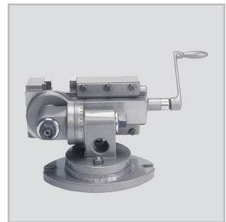
A typical case of the Universal vice set perpendicular to the base by rotation along the movable scale