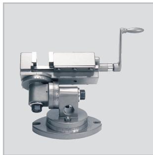
Rotation along the axis perpendicular to the axis of the swivel base