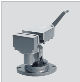
Rotation along the movable axis parallel to the axis of the swivel base