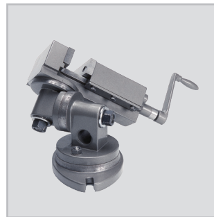
A combination of settings along the 3 axes produces the desired compound angle