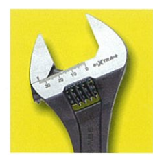
ErgoTop 99W Phosphate, left turning