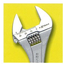
ErgoTop 92W Chrome plated

Dimensions are shown in mm unless otherwise indicated.