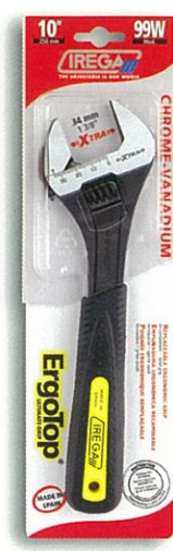
E99W / CBE