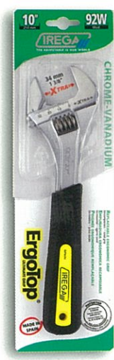
E92W / CBE