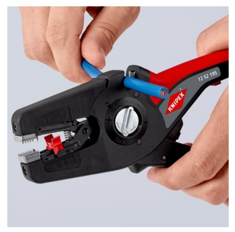
With cable cutter on the top side for up to 16 mm²