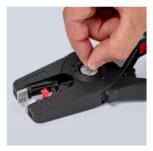
For special requirements, such as particularly hard or soft insulation materials, optimum fine adjustments can be made using the adjusting wheel with its tactile locking positions