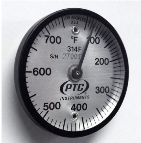
Model 314F shown actual size, 2" O.D.