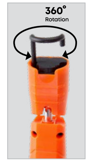
Rotating Hook with ratcheting mechanism