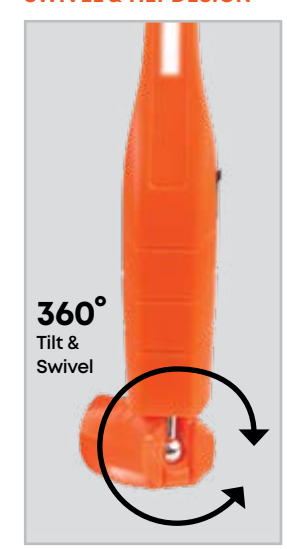
Patented 360° Swivel & tilt design with stainless steel joint