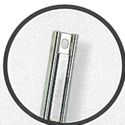
SECURE YOUR RAIL WITH MOUNTING HOLES