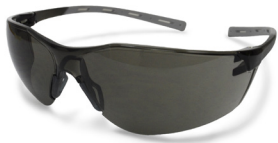
SMOKE | SMOKE ANTI-FOG

RUBBER TEMPLES For a comfortable, non-slip fit EXTRA-LONG, FLEXIBLE TEMPLES Provide a secure fit