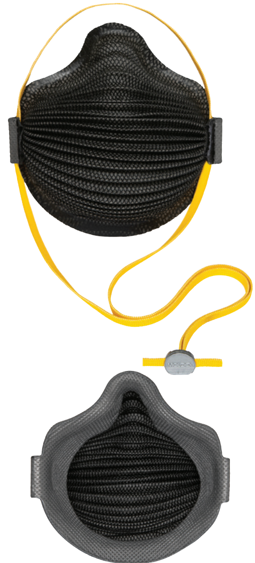
Full Foam Flange on M4620 Series

*Always refer to warnings, limitations and restrictions before using Moldex masks in any environment or application.