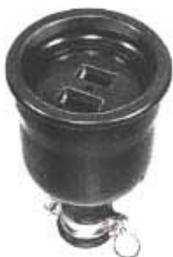
EA940BS-2 2P 30A 防水コネクタボディ 30A, 250V.