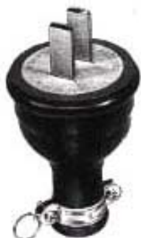
EA940BS-1 2P 30A 防水プラグ 30A, 250V.