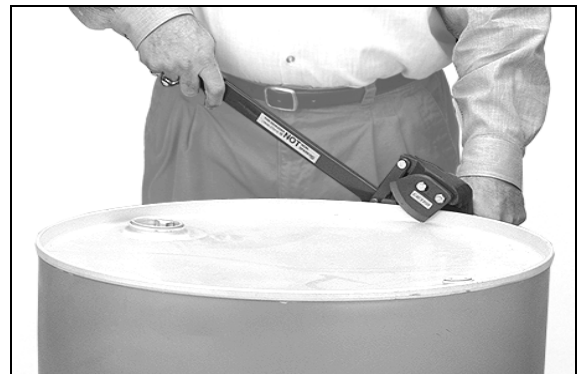
Step 4 – Figure 4