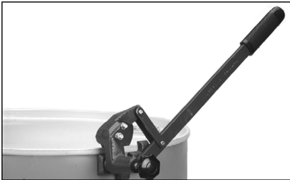
Step 3 – Figure 3