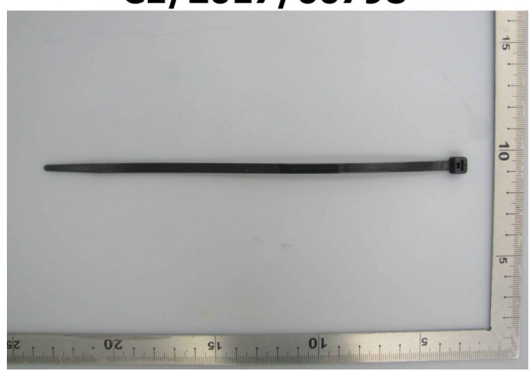
** 報告結尾 (End of Report) **

This document is issued by the Company subject to its General Conditions of Service printed overleaf, available on request or accessible at <a href="http://www.sgs.com/en/Terms-and-Conditions.aspx">http://www.sgs.com/en/Terms-and-Conditions.aspx</a> and, for electronic format documents, subject to Terms and Conditions for Electronic Documents at <a href="http://www.sgs.com/en/Terms-and-Conditions/Terms-Document aspx">http://www.sgs.com/en/Terms-and-Conditions/Terms-Document aspx</a>. Attention is drawn to the limitation of liability, indemnification and jurisdiction issues defined therein. Any holder of this document is advised that information contained hereon reflects the Company's findings at the time of its intervention only and within the limits of client's instruction, if any. The Company's sole responsibility is to its Client and this document does not exercising all their rights and obligations under the transaction documents. This document cannot be reproduced, except in full, without prior written approval of the Company. Any unauthorized alteration, forgery or falsification of the content or appearance of this document is unlawful and offenders may be prosecuted to the fullest extent of the law. Unless otherwise stated the results shown in this test report refer only to the sample(s) tested.